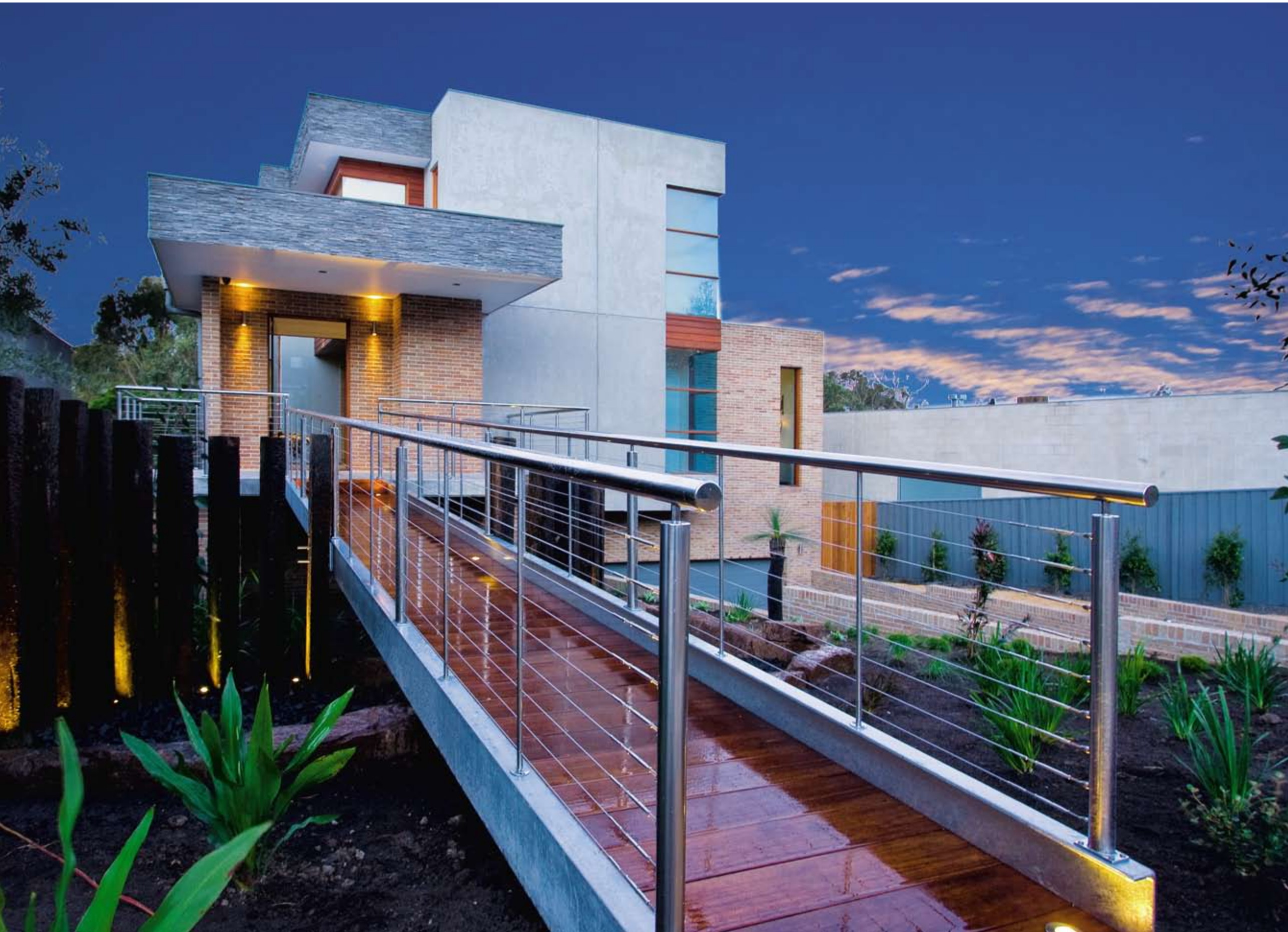
The Roman Buff Blend bricks create sophistication for this front façade.